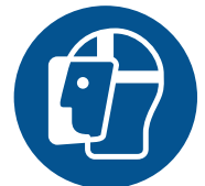
EYE & FACE PROTECTION